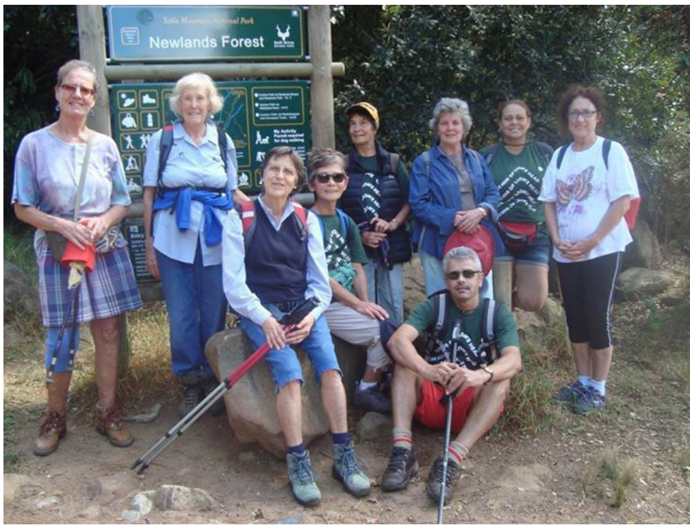
Photos taken on walk on Littlewort Trail, Newlands Forest. See report on previous page