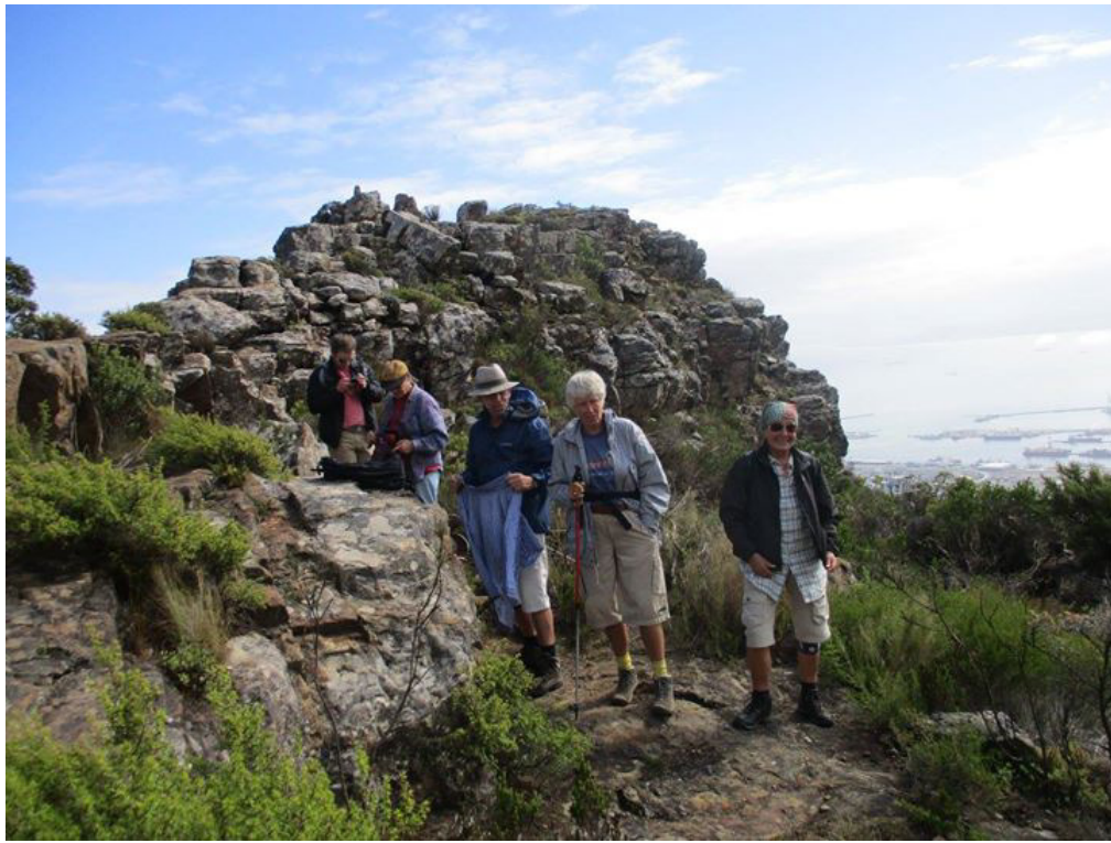
High tea: Oppelskop proved a sheltered spot for a tea break with beautiful views

A group of eight Friends of Lion's Head & Signal Hill met for an autumn walk on April 2 at the parking lot on the corner of Kloofnek and Tafelberg roads. We then drove in two cars to the start of the hike which was at the end of Tafelberg Road. It's quite a steep and fairly long climb up to the saddle, but the temperature was pleasant at around 20 C. When it started to drizzle near the Breakfast Rock we all donned our raincoats and the magic worked - soon the rain stopped!! On our way we were hit by gusts of wind, but at Oppelskop - miraculously - we found ourselves nicely protected from the wind, enjoying our tea in sunshine and with beautiful views. Everybody had a good time while walking back along the lower path - there were sightings of Nerine, April's Fool Flower and Erica abietina.